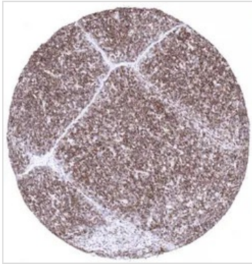
GTX04407 IHC-P Image

IHC-P analysis of human thymic cortex tissue using GTX04407 CD1a antibody [MSVA-001M] HistoMAX™. A strong CD1a immunostaining is seen in 80% of small lymphocytes in the thymic cortex.